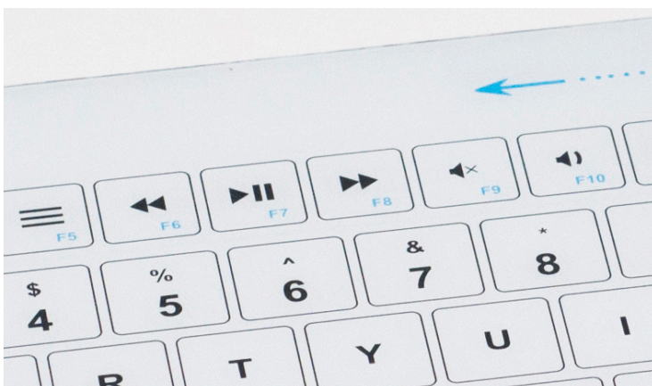
Full Video Playback Controls